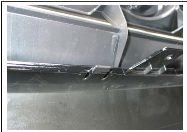
Figure 1: Lower view of grille clip. Push centre up