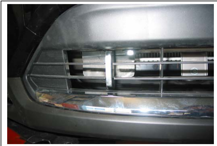
Figure 3: Trim lower grille relative to steel mounts allowing room for Nudge bar to pass thru to outside. Drivers side shown.