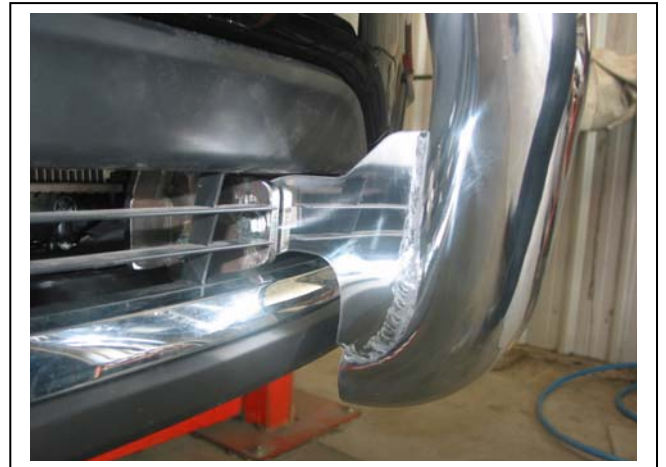
Figure 4: Mounts fitted and bumper refitted to vehicle.