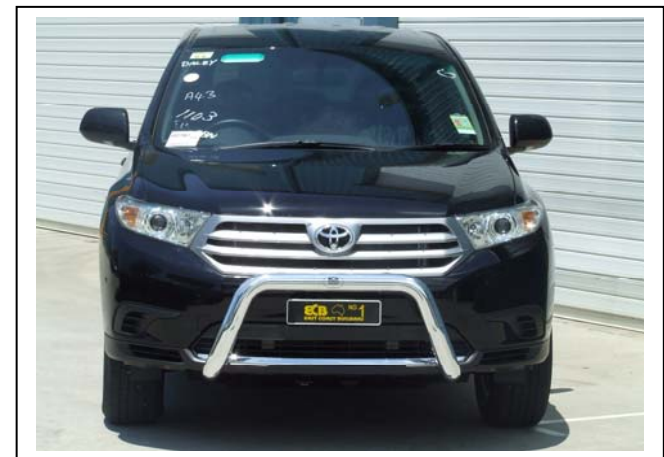
Figure 8: 76mm Nudge Bar front view