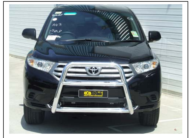
Figure 6: Series 2 Nudge Bar front view