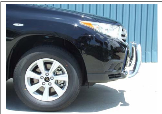
Figure 7: 76mm Nudge Bar side view